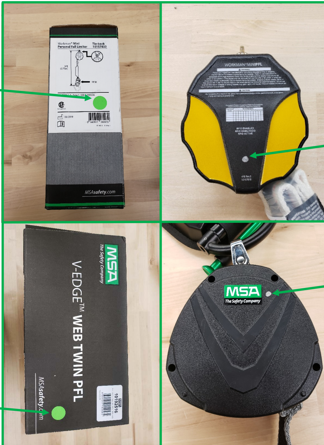
Figure 1 – Markings on MSA Inspected Product