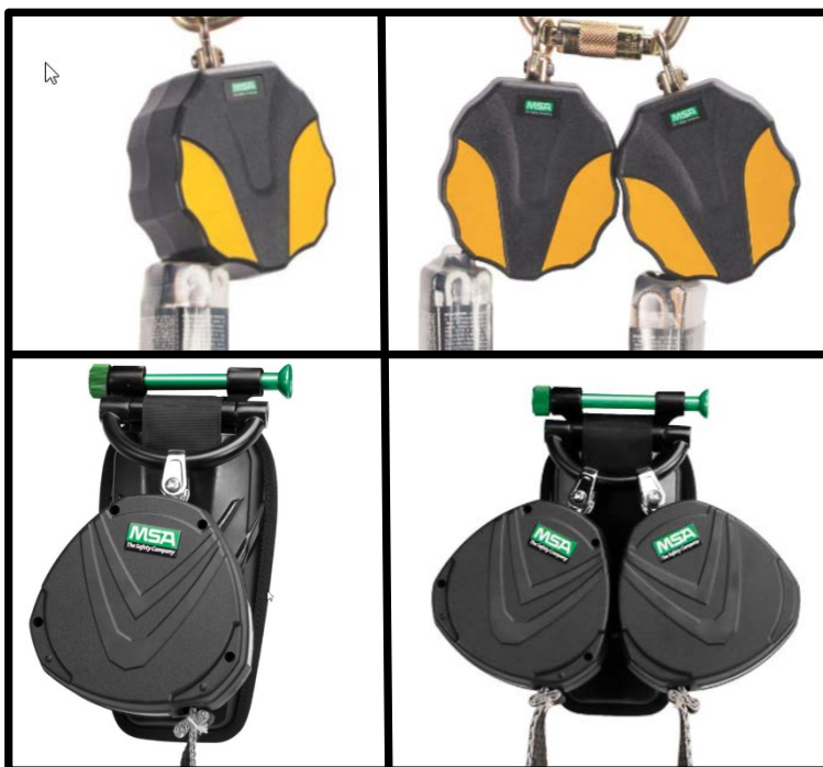
WORKMAN MINI PFL – Single and Twin Leg

Remove from service, render unusable and dispose of any PFL that does not pass the inspection.