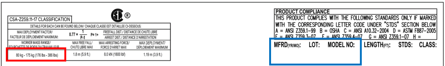
Figure 2: Example of second label. Includes part number & manufacturing date highlighted by the blue box [Step 1]. The location with the incorrect (non-matching) weight range is highlighted by red box [Step 2]